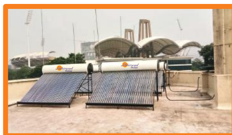
3000 LPD- Nerul, Navi Mumbai