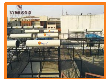
7000 LPD- Viman Nagar, Pune