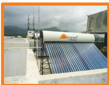
3000 LPD- Chakan, Pune